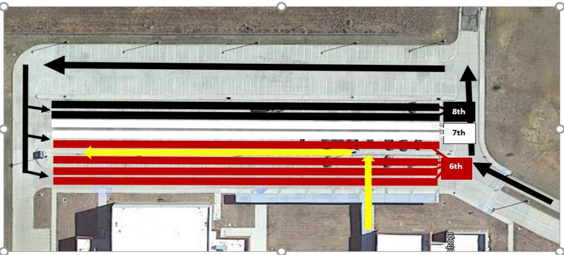
7th Grade students will walk to their cars along the first median