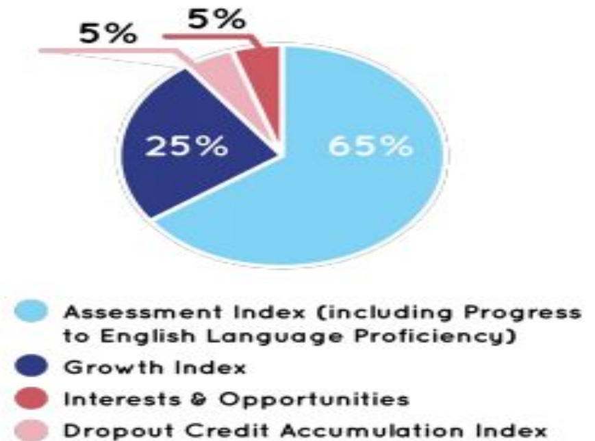
Elementary/Middle Schools (with Grade 8)